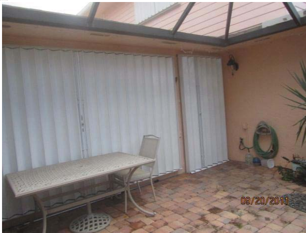
Accordions Protecting all Front Doors