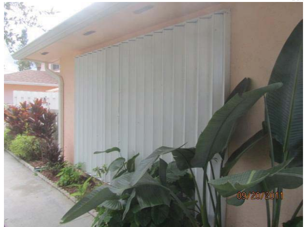
Accordions Protecting all Windows