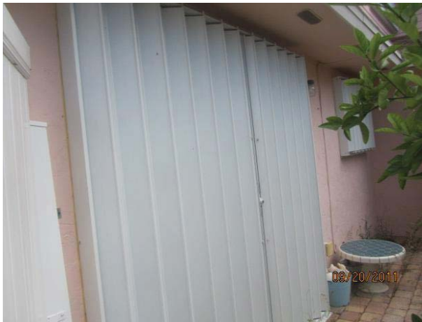
Accordions Protecting all Sliding Glass Doors